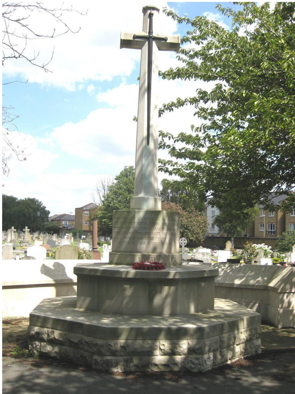
Cross of Sacrifice