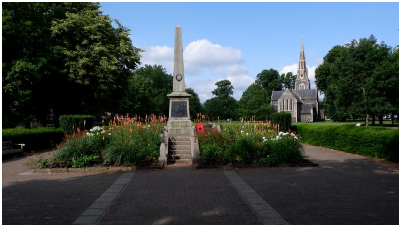
Chiswick War Memorial